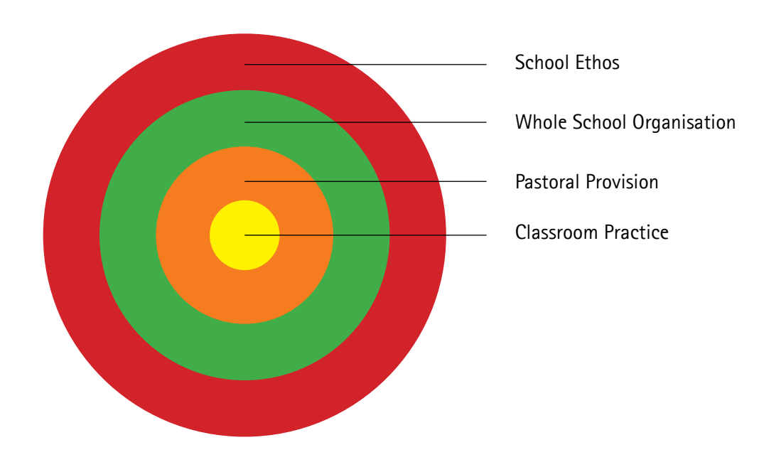
Hornby & Atkinson Model - Promoting Mental Health in Schools