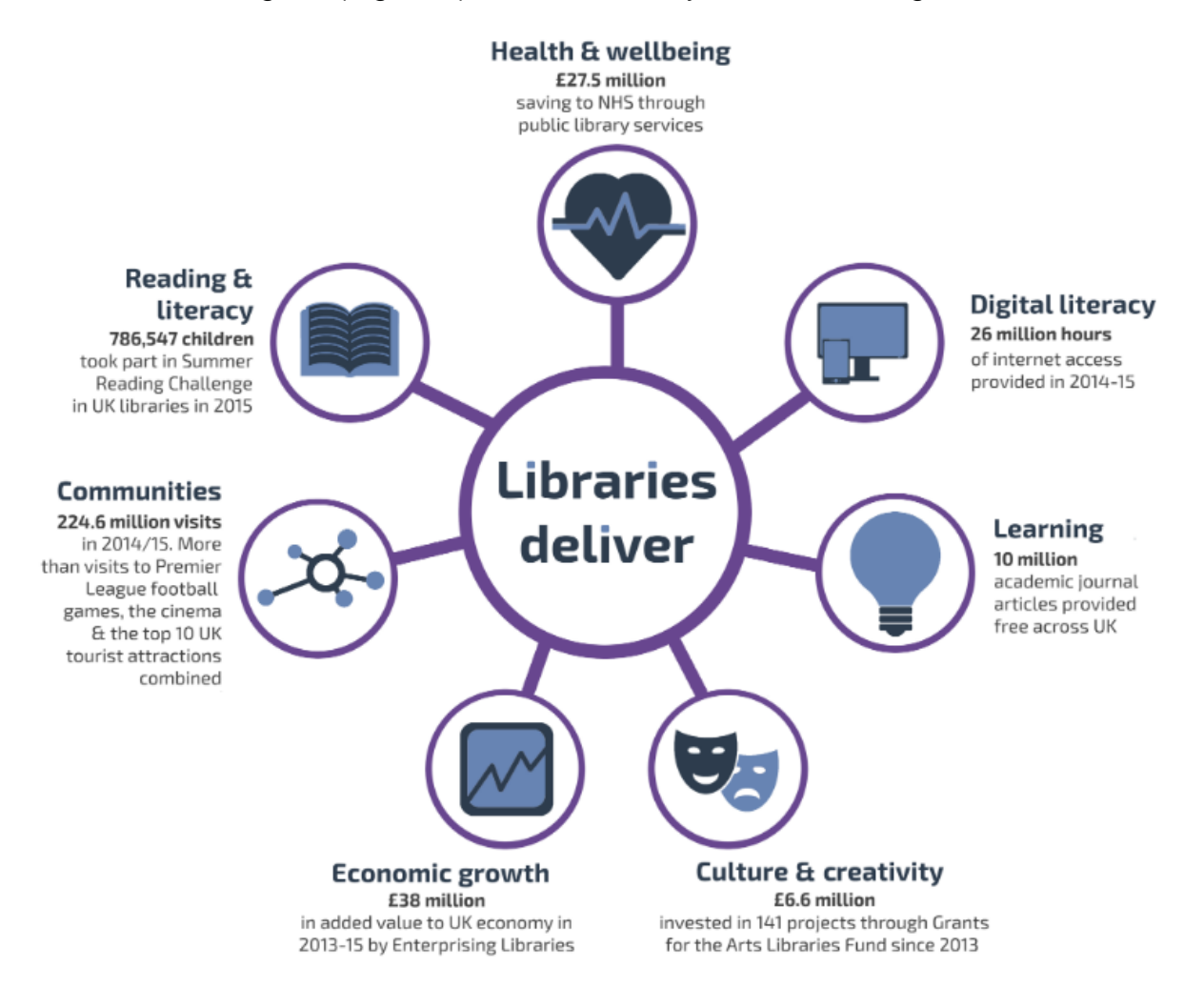
Figure 3: existing library activity in the 7 delivery areas

As can be seen from the diagram (Figure 3), libraries already demonstrate significant value in these areas: