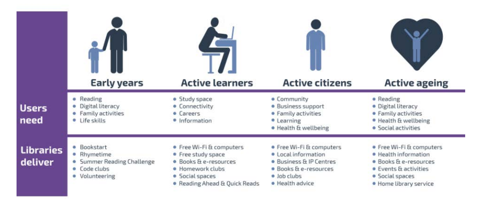
Figure 2.1: people's needs during a lifetime

Note: citations can be found in Annex 3: Image credits and references