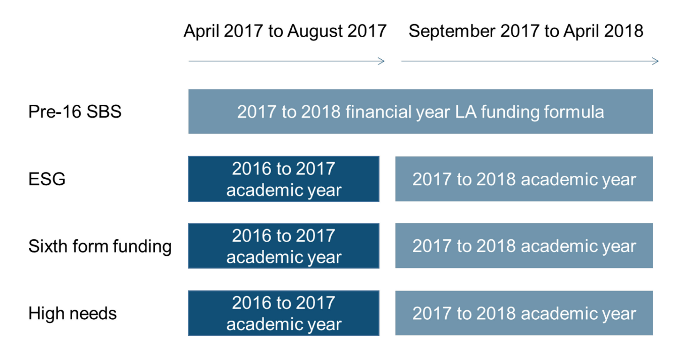
Table 9: funding factor timeline

You can find more about the ESG protection thresholds in <u>academies revenue funding</u> <u>allocations</u>.