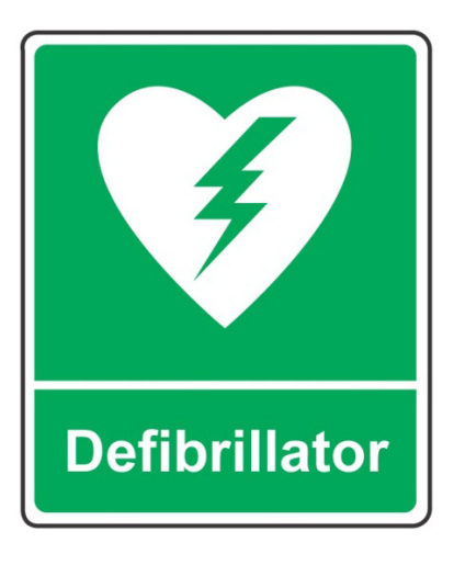
Figure 4: The UK standard sign for AEDs

All cabinets and wall brackets should be clearly marked using a standard sign for AEDs. The design recommended by the Resuscitation Council (UK) is shown below. Some suppliers may provide this as part of the AED purchase.