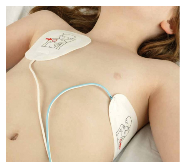
Figure 3: Paediatric AED pad placement (for use on children aged up to 8 years of age, or weighing under 25 kg)<sup>6</sup>