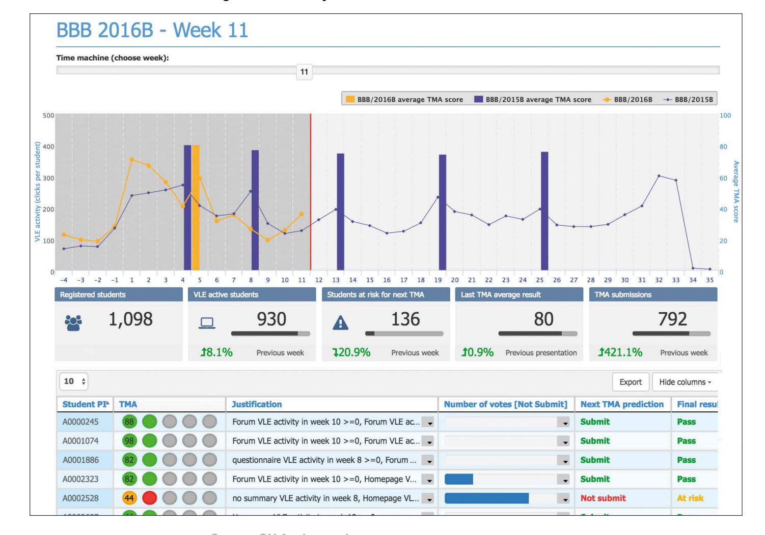
Figure 2: OU Analyse dashboard