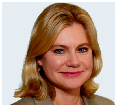
The Rt Hon JUSTINE GREENING MP Secretary of State for Education

However, in some cases, support from the NHS is only available when problems get really serious, is not consistently available across the country, and young people can sometimes wait too long to receive that support. Support for good mental health in schools and colleges is also not consistently available. This green paper therefore sets out an ambition for earlier intervention and prevention, a boost in support for the role played by schools and colleges, and better, faster access to NHS services, in order to fill these gaps and fulfil the commitments set out in our manifesto. We set out here specific proposals that represent a fundamental shift in how we will support all young people with their mental health, and we look forward to working with you in making these proposals a reality.