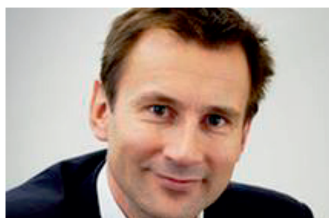
The Rt Hon JEREMY HUNT MP Secretary of State for Health