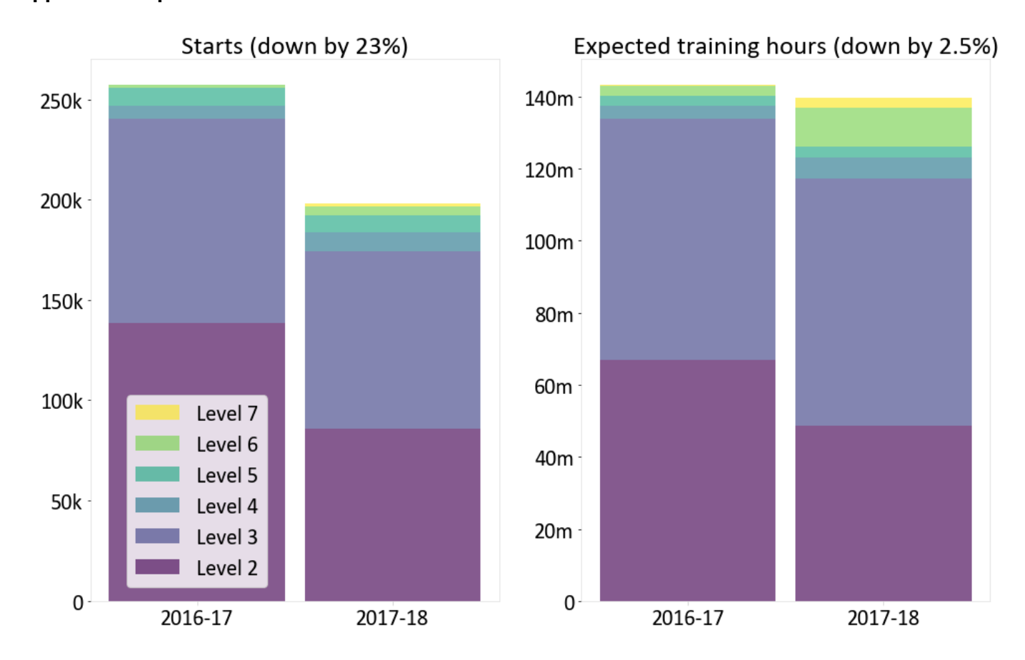
Table D: Apprenticeships starts, expected duration and expected off-the-job training hours in the first six months of the 2016/17 and 2017/18 academic years