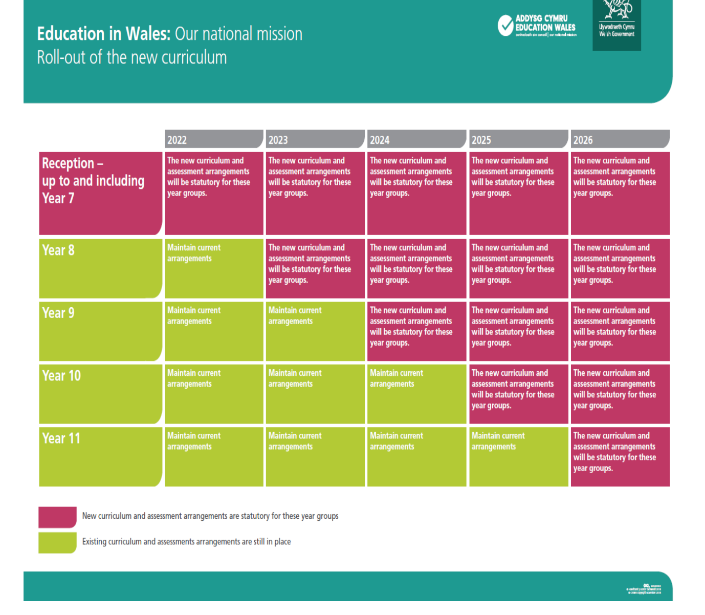
Diagram 2: Timetable for introduction of the new curriculum.

for 2023 and so on until it is introduced to Year 11 in 2026, as illustrated in the timeline.