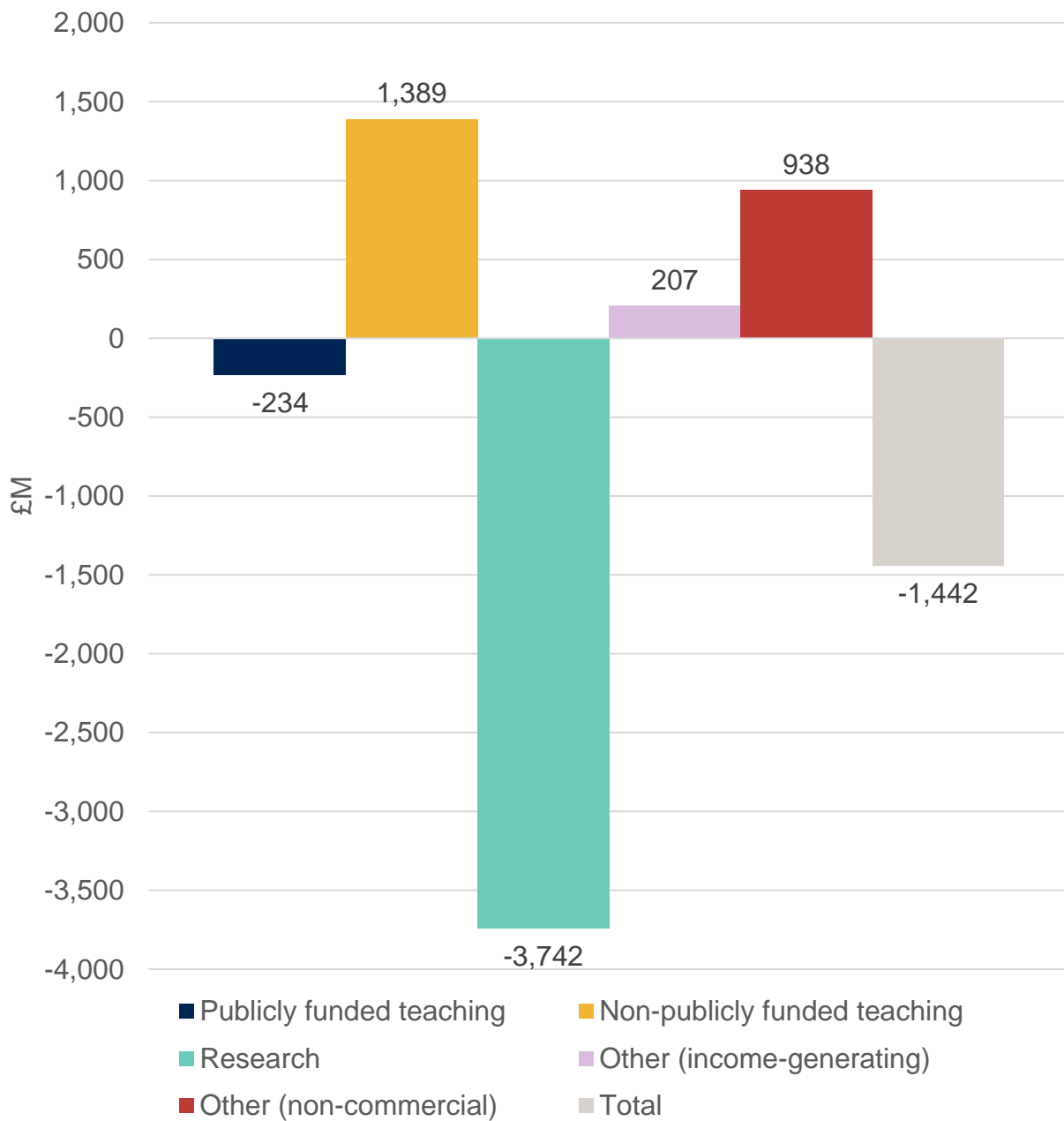
Figure 1: TRAC full economic cost surplus/deficit by activity, 2017-18 (higher education institutions in England and Northern Ireland)