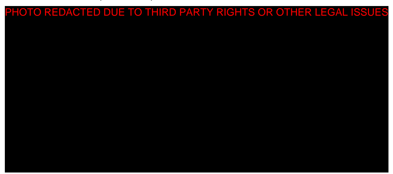
Figure 2: Adult AED pad placement

When a person suffers a cardiac arrest, it is essential for effective CPR to be initiated as soon as possible; only dialling 999 should take precedence. The person performing CPR should not stop except where this is necessary in order to attach the pads or when instructed to do so by the AED, usually before it delivers a shock. If possible, somebody else should attach the pads to the patient while CPR continues.