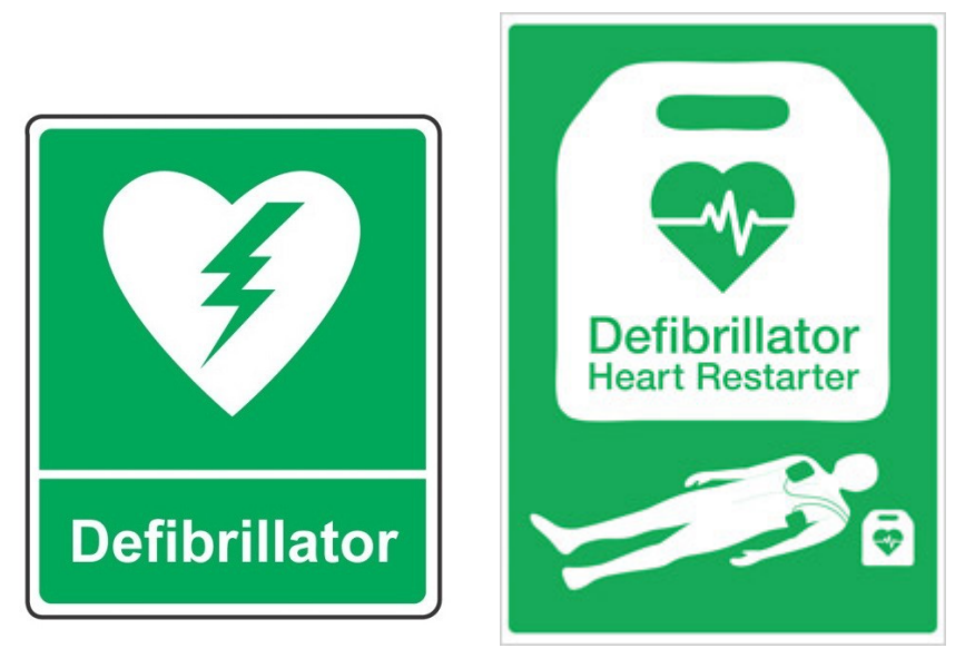
Figure 4: The UK standard sign for AEDs

All cabinets and wall brackets should be clearly marked using a standard sign for AEDs. The design recommended by the Resuscitation Council (UK) is shown below.<sup>8</sup> Some suppliers may provide this as part of the AED purchase.