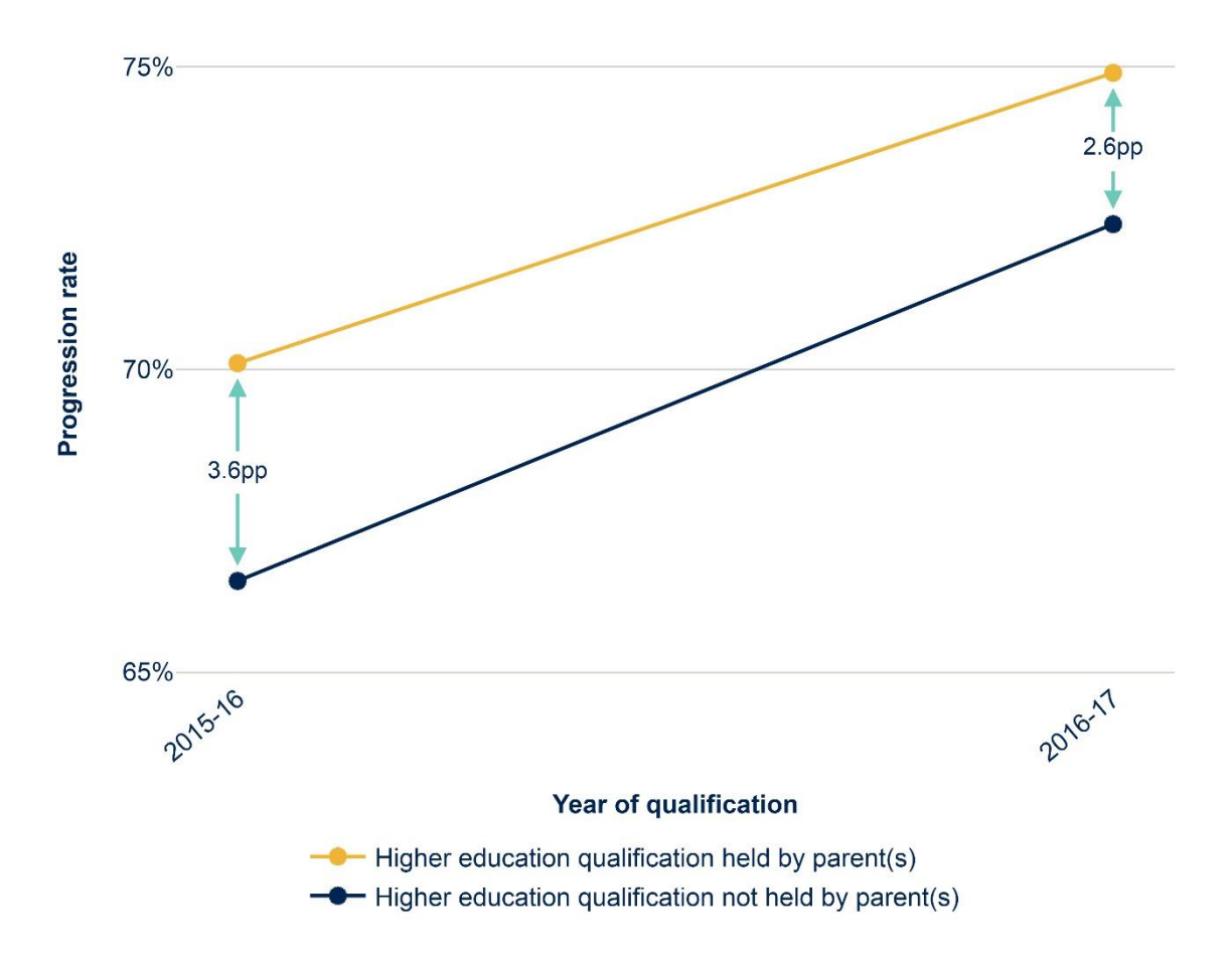
Figure D3: The differences in students progressing into highly skilled employment or further study at a higher level by parental higher education for full-time, UK-domiciled, undergraduate students

The data used to create this chart can be found in the data file associated with this publication. <sup>12</sup> Details of the student population can be found later in this annex.