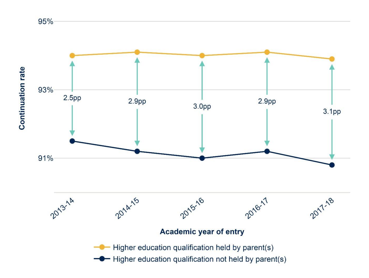
Figure D1: The differences in continuation rate by parental higher education for full-time, UK-domiciled, undergraduate students

The data used to create this chart can be found in the data file associated with this publication.<sup>4</sup> Details of the student population can be found later in this annex.