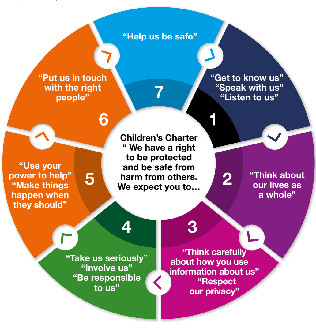
Figure 1: Expectations of children who may be involved in child protection processes.

17. Families have a range of distinct yet connected expectations. Strong themes arose from parents, support groups, advocacy and support services during the revision of this Guidance. These are reflected in Figure 2. 'Parents' here refers to parents and any other carers with parental responsibility for the child.