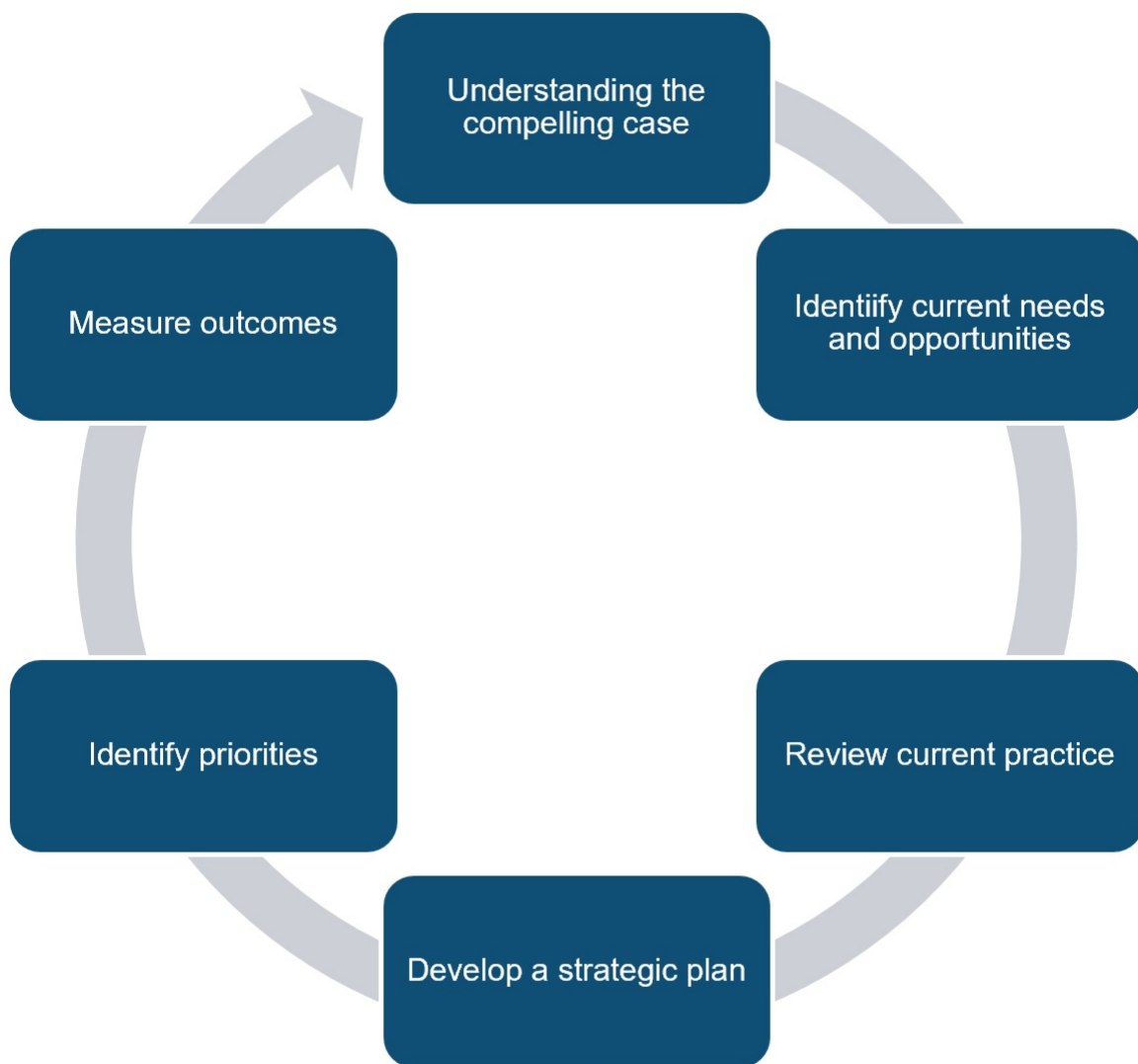
Figure 3: UUK STEPCCHANGE whole organisation approach to mental wellbeing

Internationally, in Norway, the Healthy Universities settings concept has been operationalised through a holistic intervention approach called ARK (a Norwegian acronym for work environment and climate study). ARK aims to improve the health and wellbeing of academic staff and to date has been implemented in 18 universities and colleges across Norway. 157 ARK is underpinned by the Job Demand-Resources (JD-R) theoretical framework, which states that health will be impaired when prolonged exposure to high psychosocial demand is paired with inadequate availability of resources. 158