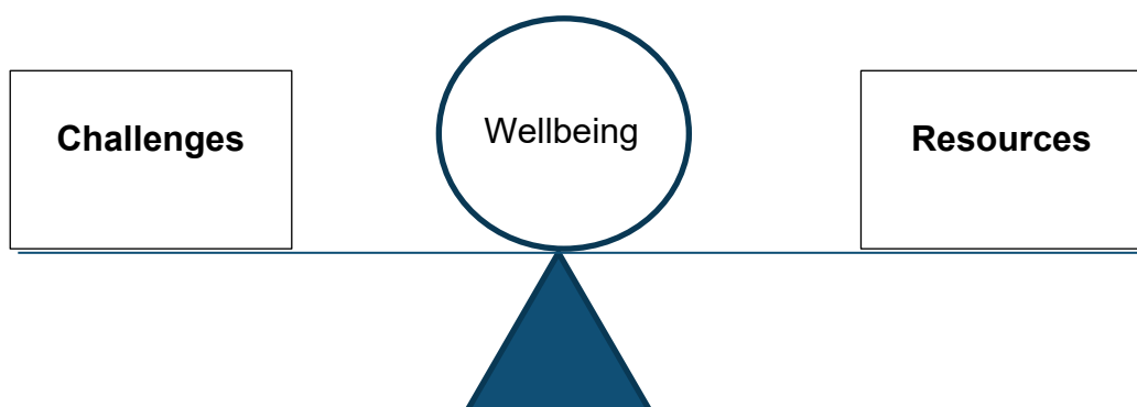
Figure 2: Definition of wellbeing (Dodge et al, 2012)

If this approach to wellbeing is applied for staff in schools and colleges, any approach would therefore need to consider: the factors impacting on wellbeing ( section 2.3 ) the provision of tools, skills and support for staff to help them address those challenges ( section 3 and section 4 ), and a strong foundation upon which to build them. Factors contributing to school and college staff wellbeing are therefore outlined below.