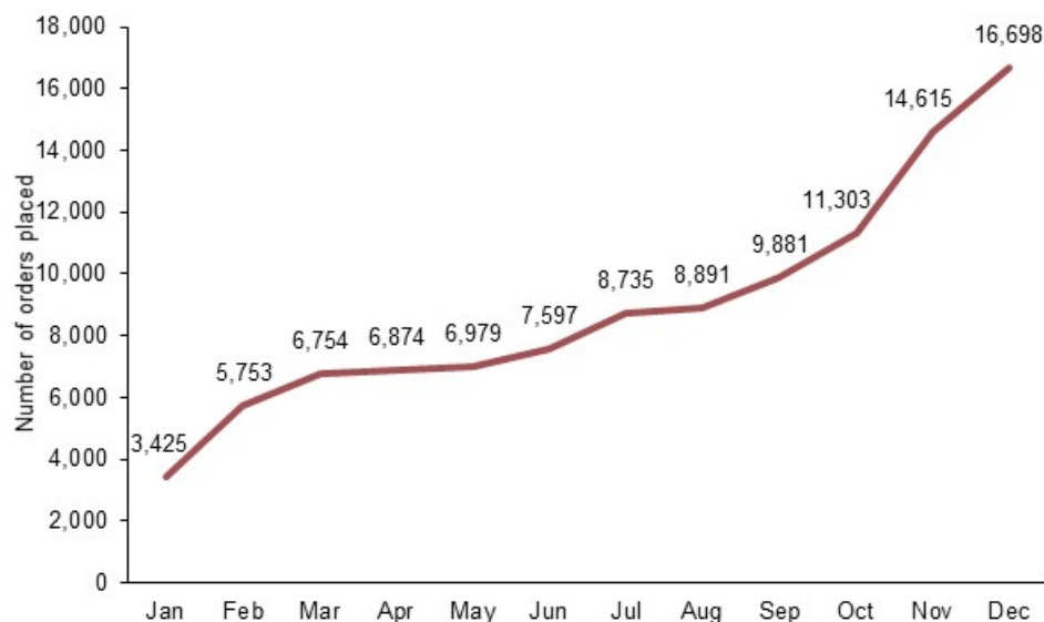
Figure 2: Number of orders placed, 2020

The total value of orders placed by the end of December was £2,791,000 which is 57% of the total spend cap for those organisations who had ordered and 48% of the total spend cap for all organisations. This is lower than expected but we expect that this is largely due