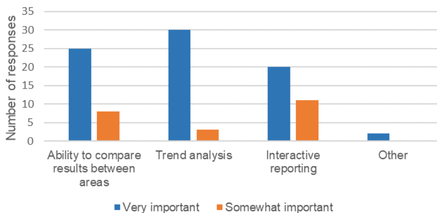
Chart 3: Priorities in the published supporting files

All respondents indicated that the ability to compare between areas, trend analysis and interactive reporting were at least somewhat useful. Trend analysis was considered very important by 91% of respondents, area comparisons by 76% of respondents, and interactive reporting by 65% of respondents. Two responses said linkage to health outcomes was another priority.