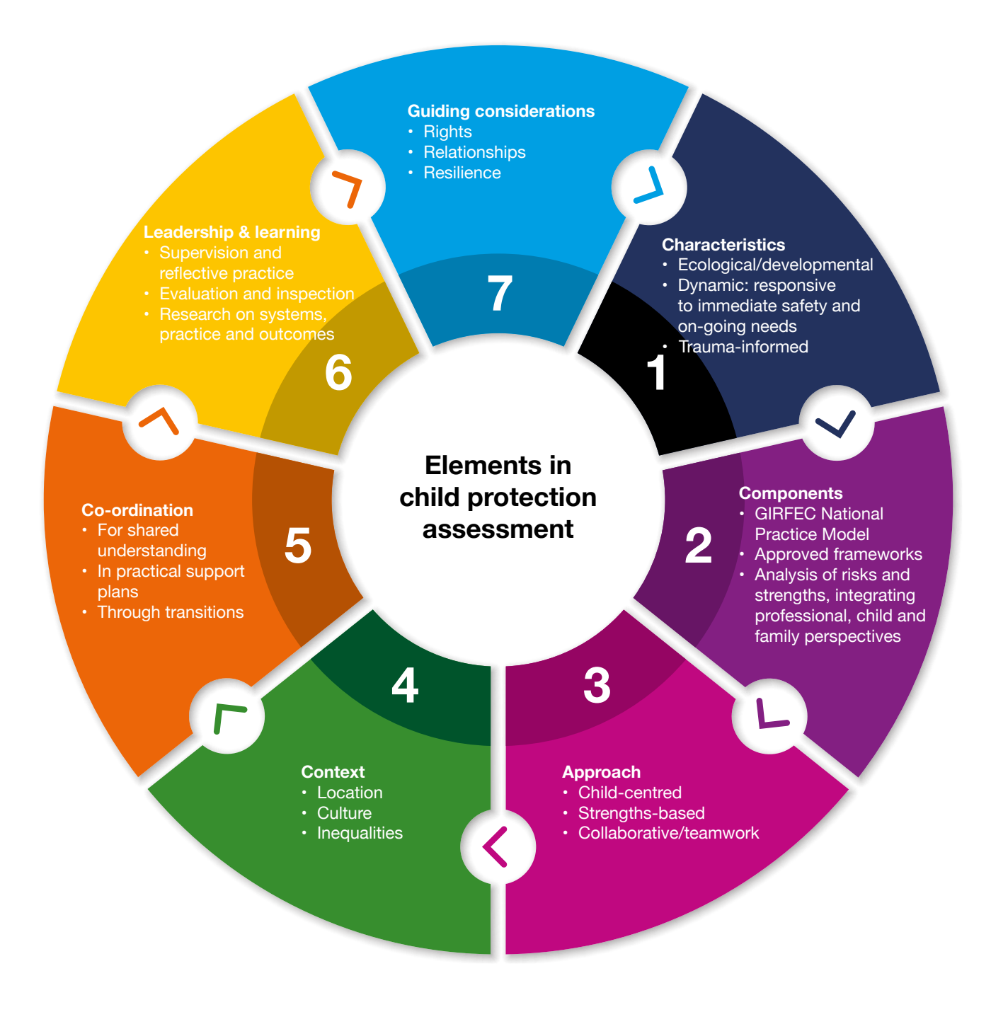
Figure 3: Elements in child protection assessment.