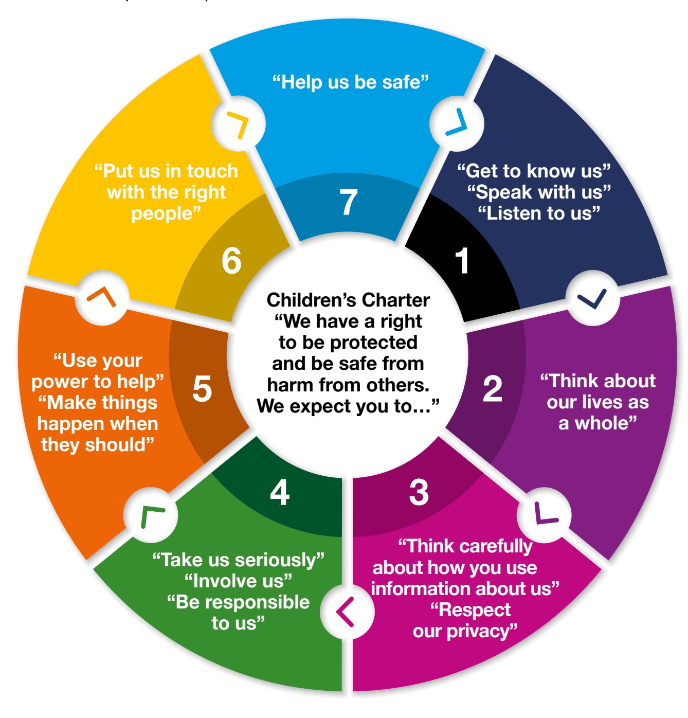
Figure 1: Expectations from children who may be involved in child protection processes.