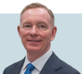
Sir Chris Bryant MP Minister of State for Trade