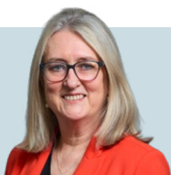
The Rt Hon Baroness Smith of Malvern Minister of State for Skills and Women and Equalities