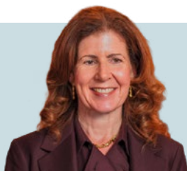
The Rt Hon Baroness Chapman of Darlington Minister of State for International Development and Africa

The world is changing fast. Geopolitical tensions, rapid technological innovation, and urgent challenges such as climate change are reshaping the way nations interact and the skills people need to thrive. In this uncertain world, education matters more than ever. This International Education Strategy sets out how we will use our country's strengths in education to expand growth and opportunity beyond our borders while serving the national interest.