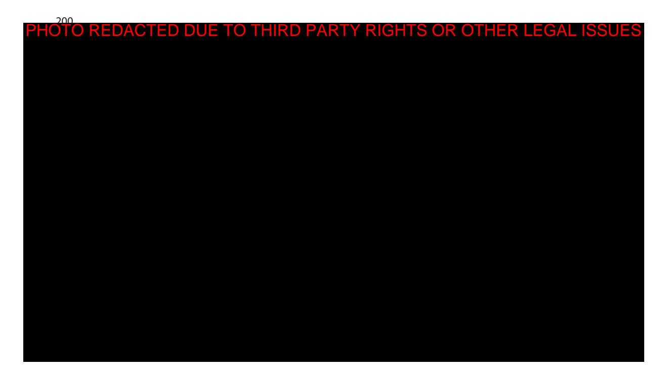
Figure 4 – Local authority education capital expenditure 2001-02 to 2007-08 (£ millions)