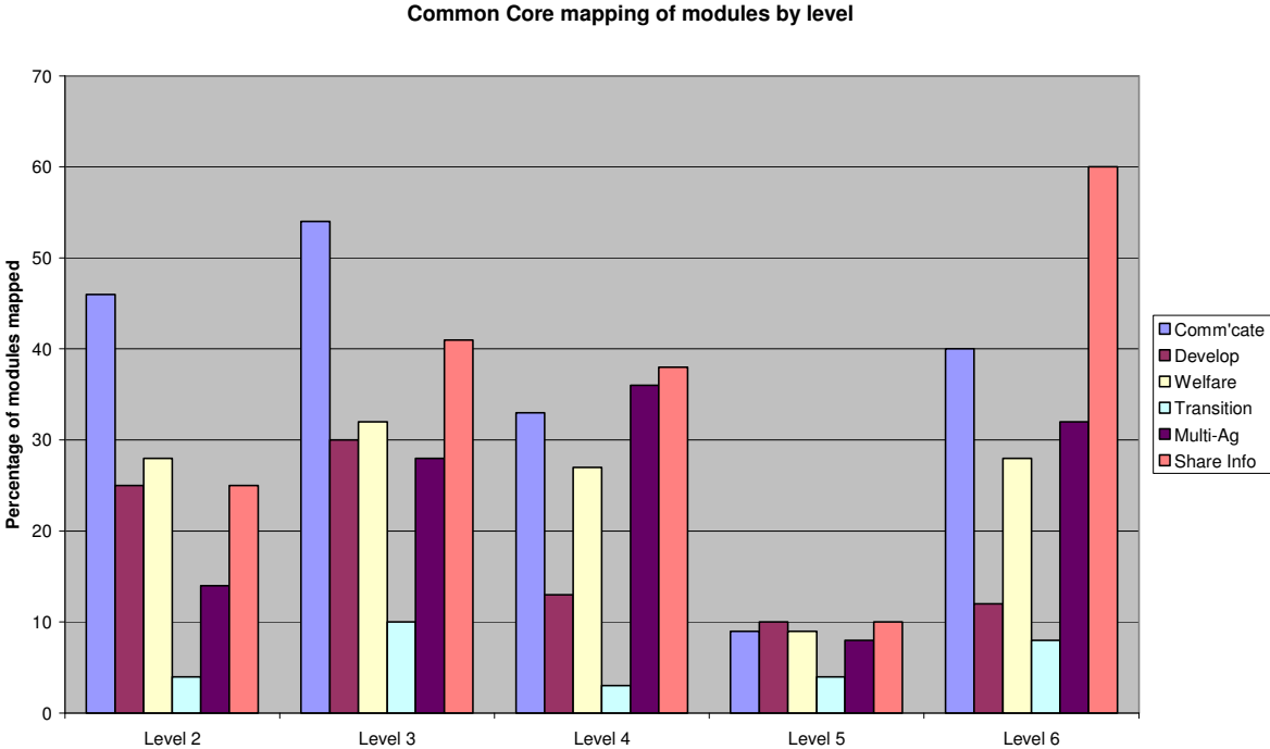
Figure 4.4 Common Core mapping by Level

This data demonstrates that in general, mapping at Level 5 is lowest across all areas of the Common Core. It also suggests that further coverage of child and young person development in modules at Levels 4. Coverage of multi-agency working is good at Levels 3 and 4 but could be boosted at Levels 2 and 5.