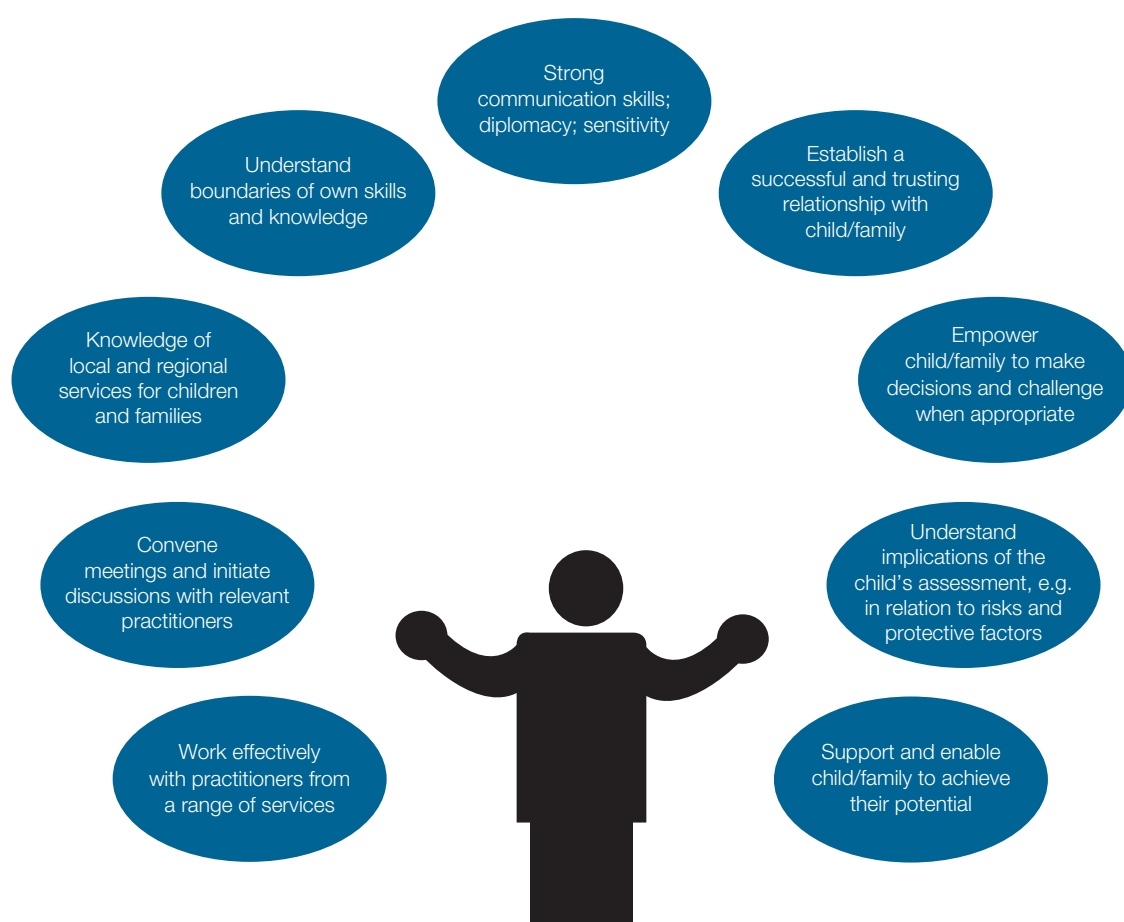
Figure 3: Useful skills for carrying out the lead professional functions

3.2 Lead professionals, like all practitioners, should understand information sharing procedures and issues around client confidentiality. Don't worry if you feel there are areas you need to develop – use Figure 3 as the basis for a discussion with your line manager.