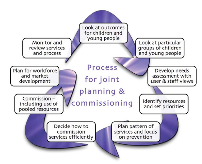
Figure 5.1: Nine step model for joint commissioning and assessment<sup>62</sup>

149. In 2006 about half (16/31) of children's trust pathfinders reported having joint commissioning strategies in place, and most (9/15) of the rest said they were developing one. Nine pathfinders described their commissioning models, of which five had used the nine step model suggested by the Department for Education and Skills (see Figure 5.1) or had adapted it, for example to include decommissioning. The other commissioning models pre-dated the central government guidance.