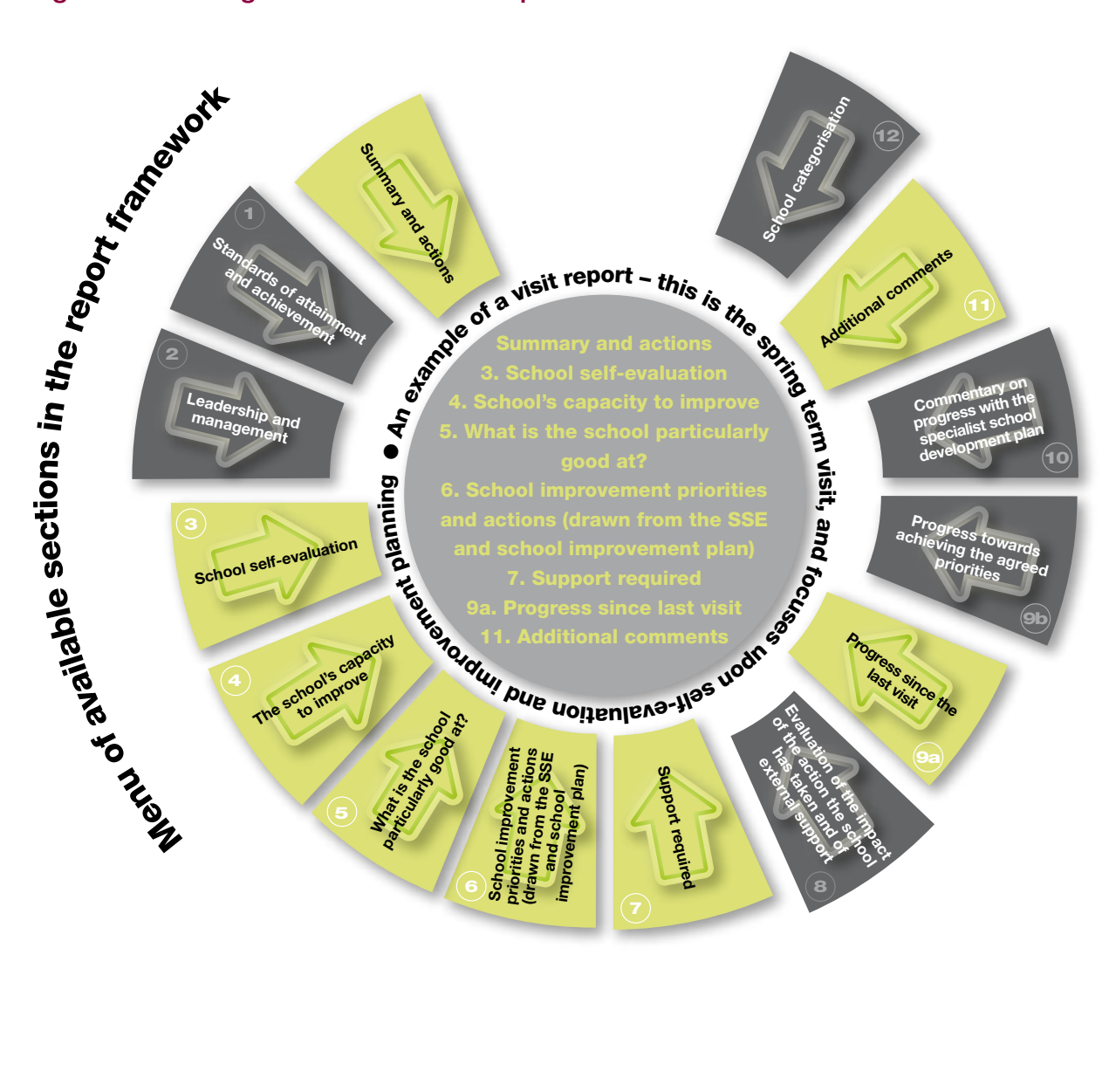
Figure 1: Creating an individual visit report

The next section examines each section of the reporting framework, and the associated report proforma, and provides guidance and examples of report writing following the principles outlined earlier.