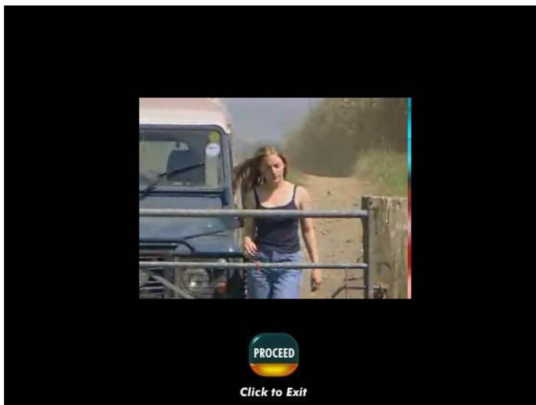
Figure 4: Example screen of information provided in video form with a young person's voice-over

On one Connexions service website, voice-overs are provided for videos that show a wide range of jobs (although the voices are adult rather than those of young people). Young peoples' voices are used on the videos describing Modern Apprenticeships (an example screen is shown in Figure 4).