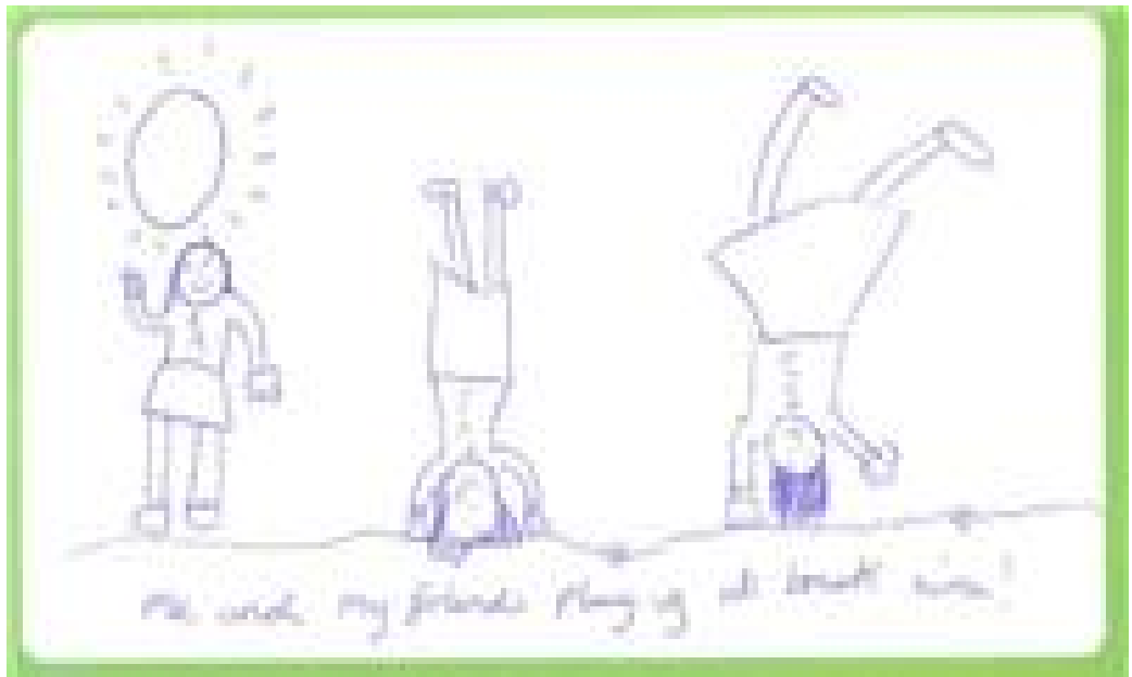
“Me and my friends playing at break time!” Dudley.

Discussion of play areas, too, sometimes led to consideration of the school playground and the type of equipment children want to see there. Of the children and young people consulted in Hartlepool, 57% wanted more access to school grounds outside of school time – apparently in answer to a direct question. Children in Tynedale also wanted access to their school grounds. More generally, however, children and young people’s association of play and school suggests a more ambivalent relationship. In Birmingham, 50% of children using the booklet questionnaire said that they were part of after school clubs, but the number of children and young people who said in their questionnaires (both formats) that they would like to play in school was 18%. In general, the evidence for how schools can support children’s play – during and after the day – is limited. More detailed exploration in this area would need to bear in mind the distinction drawn by a young person in Newcastle: