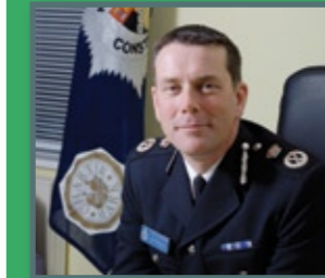
Ian McPherson, Chief Constable of Norfolk Police and head of the Association of Chief Police Officers (ACPO) Business Area for Children and Young People

This erosion of confidence is disappointing because 11 MILLION's survey shows that 73 per cent of children and young people like or quite like the police. Views become more negative with age, dipping steeply at ages 12 and 13, and are less favourable among BME children and young people. Some 48 per cent of children and young people believe that they are either very respected or quite respected by the police. A significant number say they do not know whether they like the police, or whether the police like them (11 per cent and 15 per cent respectively).