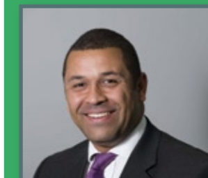
James Cleverly AM, The Mayor of London’s Ambassador for Young People

There is no evidence that increasing the use of custody or the length of sentences reduces the level of gun and knife violence. 97 Although sentences have a deterrent effect, the extent to which they deter does not appear to rise or fall in relation to the severity of the sentence. 98 Comments of young people working with 11 MILLION suggest why more severe sentencing would be particularly problematic in the case of children and young people who possess or use weapons. The drivers of these behaviours can feel far more compelling than the potential loss of liberty. Custodial sentences are less likely than any other type of sentence to prevent youth reoffending. 99 Worryingly, the seriousness of offending of some young men sentenced for gun crime through Operation Trident increased after their incarceration. 100